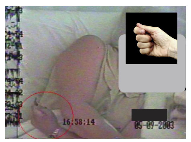
FIGURE 4: Representative hand posture (HP) of a 34-year-old female patient showing ictal left-hand politician's fist posturing. We report this patient because her HP remained unchanged after a right parietal lesionectomy that did not lead to seizure freedom, which was accomplished 2 years later after right anteromedial temporal resection. [Color figure can be viewed at www.annalsofneurology.org]

Each seizure was independently evaluated; therefore, 1 patient may present >1 HP. Of note, only 2 frontal patients presented HPs suggestive of both frontal and temporal EZ localizations (fist and politician's fist). All other patients that presented >1 HP had either frontal lobe EZ localization with a combination of both fist and pointing HPs, or temporal lobe EZ localizations, with a combination of cup, pincer, and politician's fist HPs. A summary of the number of patients with specific HPs can be found in Figure 3. Interrater reliability of patients' categorization